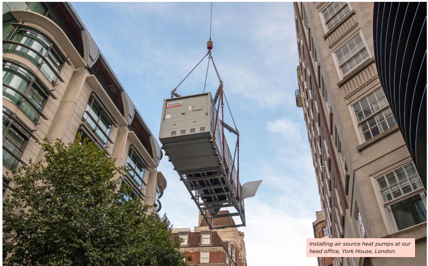
Installing air source heat pumps at our head office, York House, London.

Consider opportunities to support a just transition – ensuring a fair and inclusive journey to a net zero, resilient future where people and nature thrive.