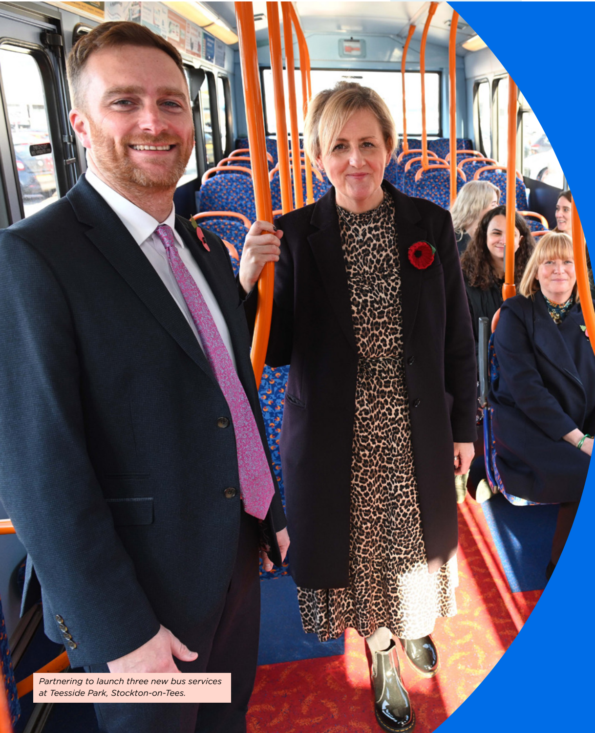
Partnering to launch three new bus services at Teesside Park, Stockton-on-Tees.