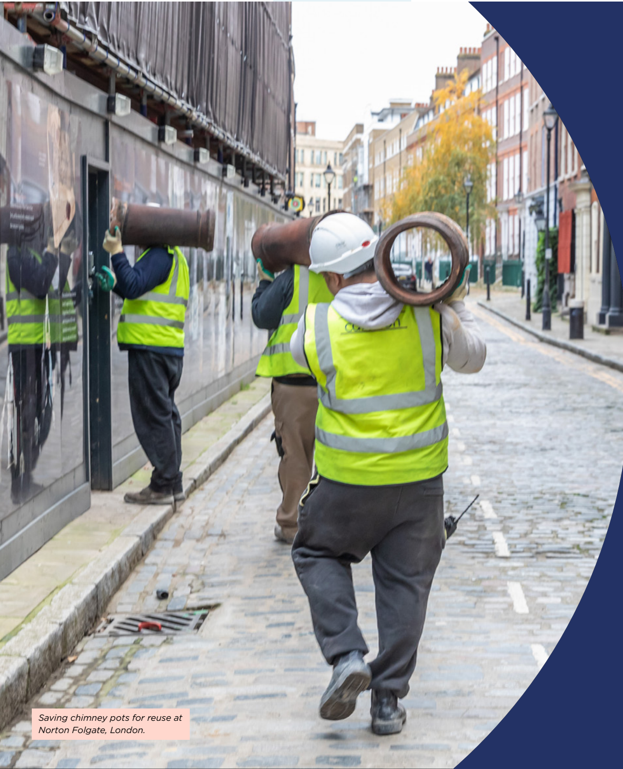
Saving chimney pots for reuse at Norton Folgate, London.