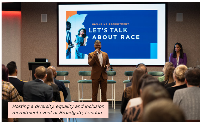
Hosting a diversity, equality and inclusion recruitment event at Broadgate, London.