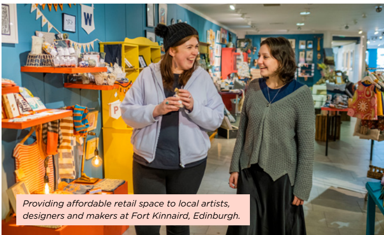
Providing affordable retail space to local artists, designers and makers at Fort Kinnaird, Edinburgh.