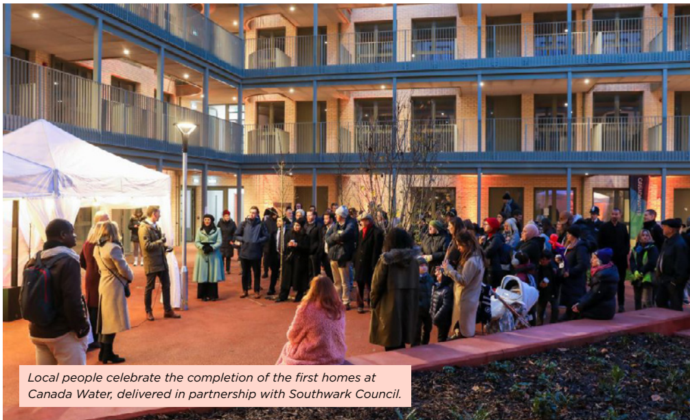
Local people celebrate the completion of the first homes at Canada Water, delivered in partnership with Southwark Council.