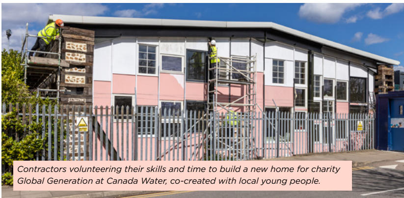
Contractors volunteering their skills and time to build a new home for charity Global Generation at Canada Water, co-created with local young people.