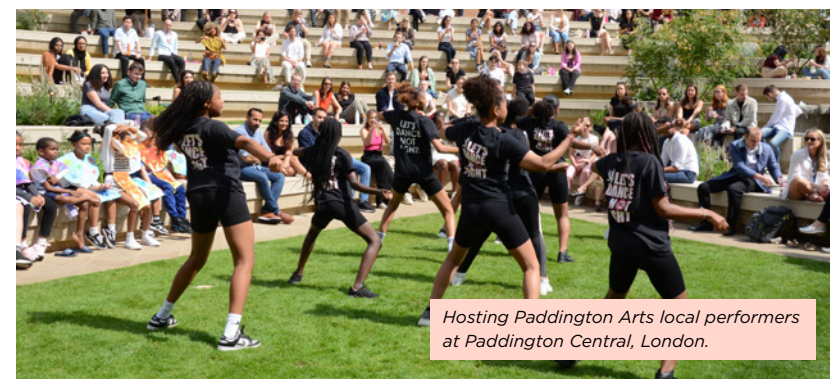
Hosting Paddington Arts local performers at Paddington Central, London.

Consider opportunities to develop green skills through Education and Employment initiatives, supporting a just transition.