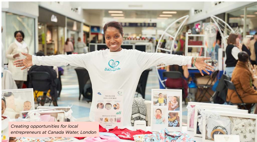
Creating opportunities for local entrepreneurs at Canada Water, London